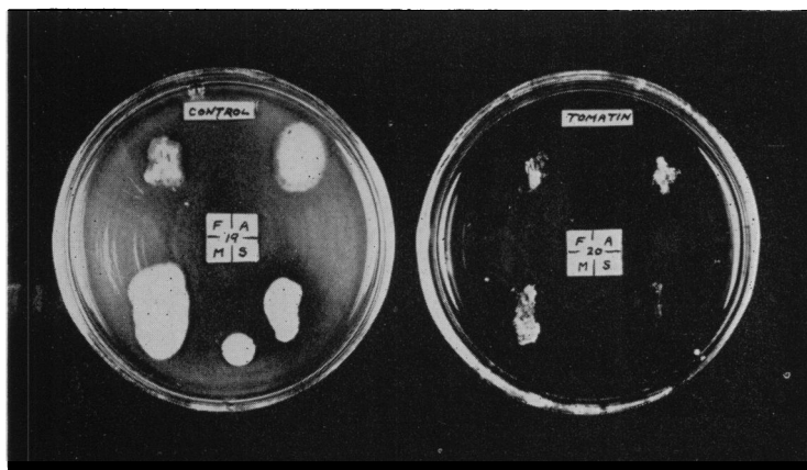
FIG. 2. EFFECT OF ADDITION OF TOMATIN TO THE MEDIUM ON THE GROWTH OF SEVERAL ORGANISMS

It is noteworthy that tomatin not only strongly inhibits a highly virulent strain of Fusarium oxysporum f. lycopersici , the organism that causes wilt in the tomato plant, but it also inhibits, to an equal or greater degree, the Fusarium species that cause similar wilt diseases in peas and cabbage. The role played by tomatin in the natural wilt resistance exhibited by some varieties of tomatoes