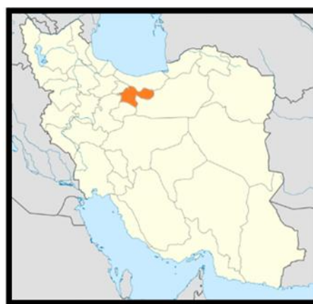
Fig.1. The map of Iran and location of Tehran city

utes) had lowest to highest LT50 (Table 2 and 3). The result also showed that among these insecticides, Lab strain is susceptible to Lambdacyhalothrin, deltamethrin, cyfluthrin and resistance to DDT according to WHO criteria that suggested (98-100% mortality indicates susceptibility, 90-97% mortality indicates resistance candidate (more investigation is needed or requires confirmation of resistance with other methods) and <90% mortality suggests resistance) (WHO 2013). And also cyfluthrin with LT 50 =45 Sec and DDT with LT 50 =3005 were the most and least effect (Table 1,3 and Fig. 2,3).