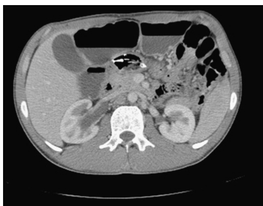
Fig. 2. Dilated bowel with air fluid levels and right sided hydronephrosis.

A right-sided ureteric stent was inserted. Pouchoscopy was attempted but the pouch was inaccessible due to a very narrow lumen. Biopsies were taken from abnormal mucosa below the pouch, and histology showed chronic colitis and an adenomatous polyp with low grade dysplasia. The patient was discharged home with close follow-up.