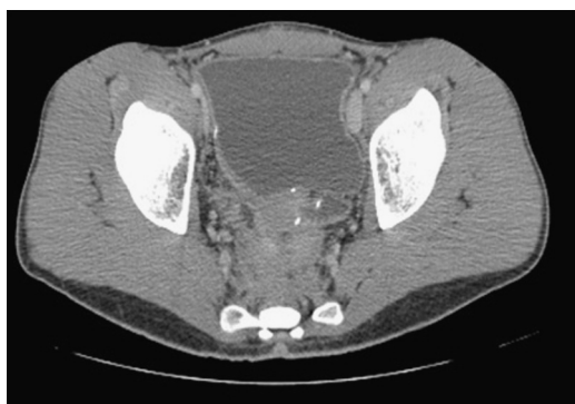
Fig. 1. Dilated fluid-filled bowel with a pre-sacral mass.