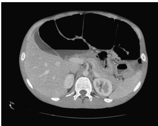
Fig. 4. Severely dilated bowel with air fluid levels.