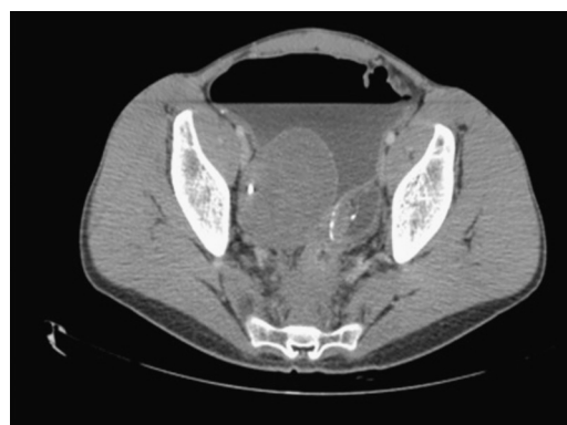
Fig. 3. Dilated fluid-filled bowel with an enlarging pre-sacral mass.