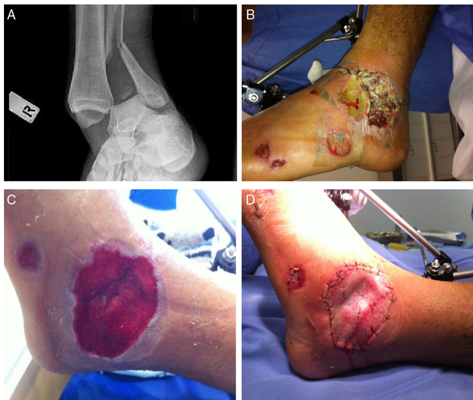
Fig. 1 – Patient victim of motorcycle accident. (A) Presence of exposed ankle fracture; (B) External fixation of the ankle and presence of local infection; (C) Appearance after 28 days of VAC therapy; and (D) Skin grafting.

causative agent was found to be Staphylococcus aureus (Table 2). After diagnosis, all patients underwent surgical treatment (debridement and local wound irrigation), followed by local treatment of the injury with NPWT.