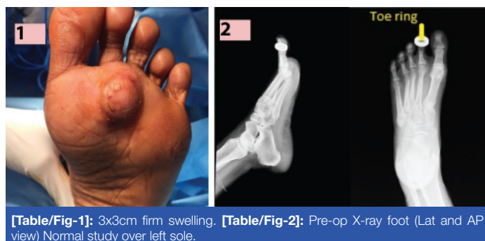
[Table/Fig-1]: 3x3cm firm swelling. [Table/Fig-2]: Pre-op X-ray foot (Lat and AP view) Normal study over left sole.

Informed consent was obtained and excision of the swelling was performed [Table/Fig-3,4] under spinal anaesthesia. Vertically oval skin incision was made over the swelling and swelling was excised in toto. Excised tissue was sent for histopathological examination. Intraoperative finding [Table/Fig-5] was 3x3 cm sized well encapsulated cystic lesion containing pultaceous material. Post-operative period was uneventful. Histopathology [Table/Fig-6] report showing a thin fibro-collagenous cyst, wall is lined by stratified squamous epithelium with prominent granular layer. Cyst contains lamellated keratin, which confirmed it as epidermoid cyst.