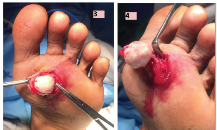
[Table/Fig-3]: Swelling after partial dissection. [Table/Fig-4]: Swelling showing no deep extension.

Keywords: Palmoplantar cyst, Sequestration, Trauma