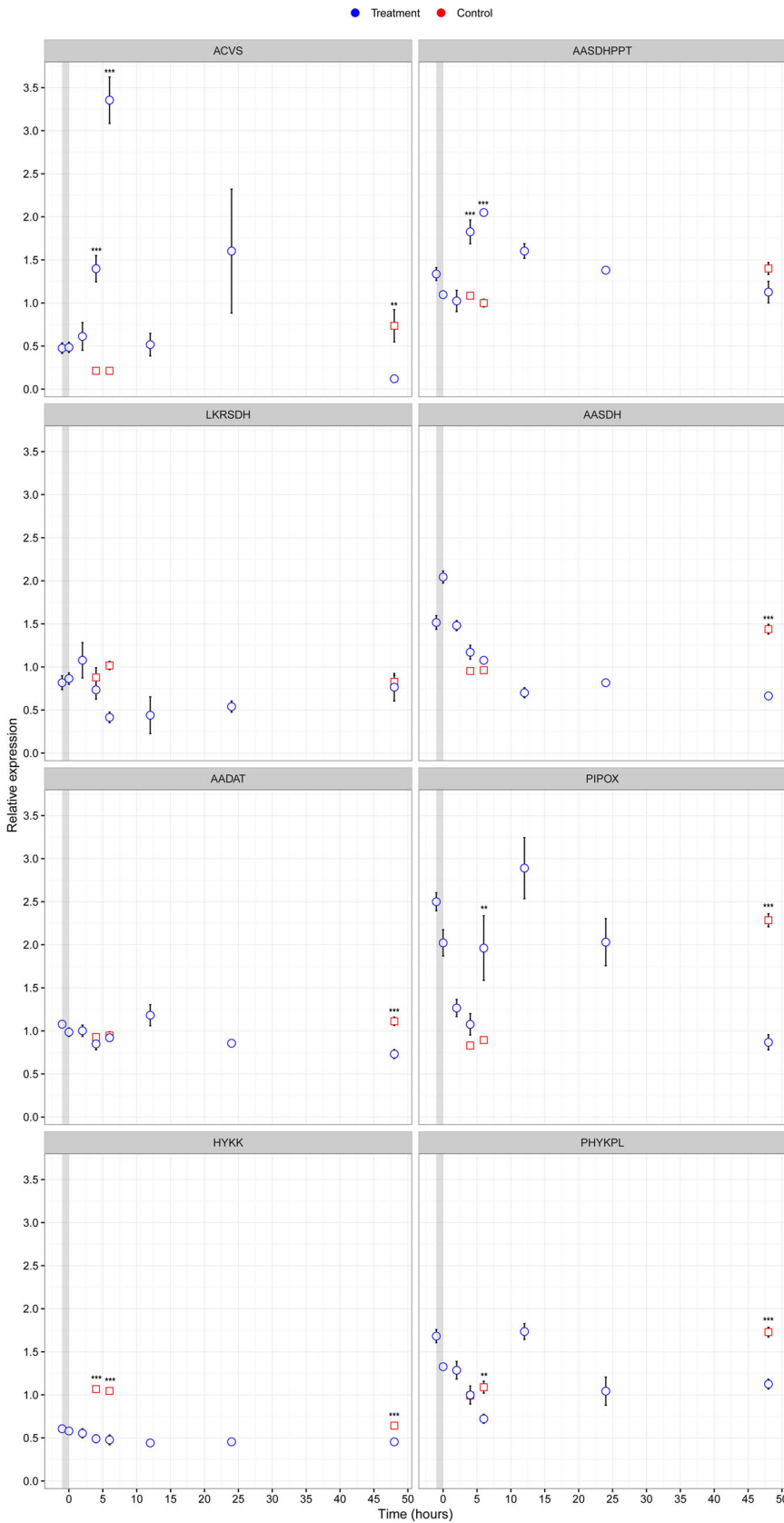
Fig. 2. Relative expression of supporting pathways for beta-lactam biosynthesis in F. candida after heat shock. Gene expressions were determined from qPCR-derived cycle threshold values for cDNA amplification relative to two reference genes. Points depict observed means for each sampling time ( n=4 ) and error bars depict the standard error of the means as a function of time. Blue bullets, samples that received heat shock; red squares, controls. The grey column represents the time of the heat shock. Asterisks depict significance level, (* P<0.05 ; ** P<0.01 ; *** P<0.001 ) from the two-way ANOVA analysis in R 3.2.2.

in F. candida may also be more directly related to the effects of heat stress which could be more important for its survival than their role in beta-lactam biosynthesis.