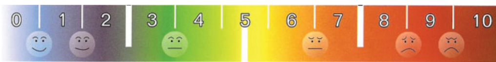
Fig. 1 “Visual Analogue Scale – VAS” presented to the patient.

points, tender points, and disc herniation are the common etiological diagnoses.