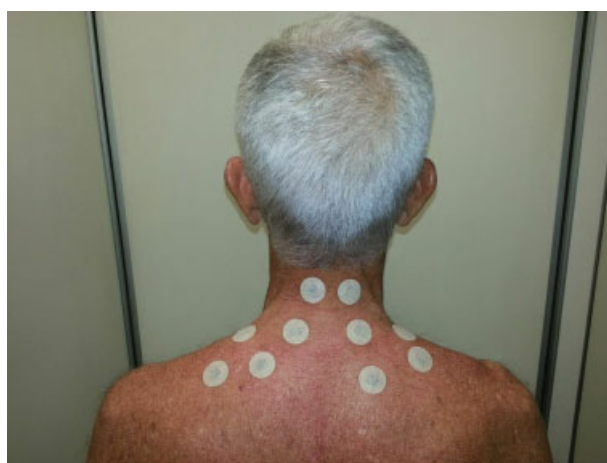
Fig. 2 Distribution of the 10 tablets containing nanotubes.

In a preliminary study conducted before this one, we noticed a decrease in pain and dizziness scores throughout two weeks of patches treatment. Therefore, we tracked out the patient on a biweekly basis. We changed the patches during the first visit, which was 15 days after the beginning of treatment. At this point, one of the subjects was excluded from the study due to patch loss. We recorded the remaining seven subjects pain and dizziness levels using the VAS on a twice week basis. A Computerized Dynamic Posturography (CPD) was performed at the end of four weeks. We plotted sex, age, pain, and dizziness scores in a table. We analyzed