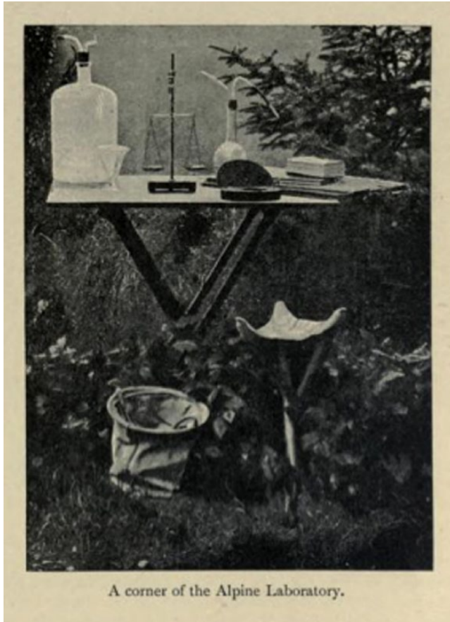
A corner of the Alpine Laboratory.