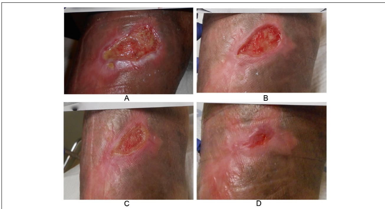
Figure 1. Study wound 3. (A) Baseline: 9.7 cm 2 wound of the right anterolateral tibia with a duration of 256 days prior to application of vCPM. (B) Day 49: 50.5% PAR after 5 applications (C) Day 56: 71.5% PAR after 6 applications. (D) Day 77: Final wound closure following 9 vCPM applications. PAR, percentage area reduction; vCPM, viable intact cryopreserved human placental membrane.