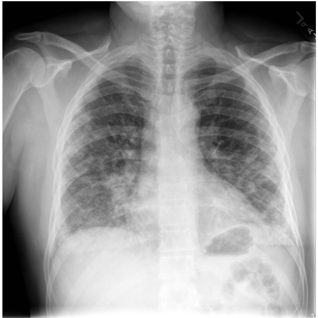
FIGURE 2: Chest X-ray (PA view): adjacent left basilar infiltrates and mild atelectasis. No infiltrates are seen on the right side