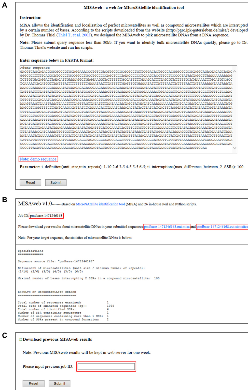
Figure 3. Screenshots of main functional web interface in MISAweb. (A) Sequence input web interface. (B) Microsatellite DNAs result web interface. (C) Previous result retrieving module.