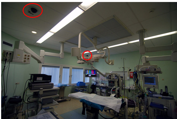
Fig. 1 Conventional cart-based OR (dome cameras are circled)

Patient and procedure characteristics were derived by chart review. For statistical analysis, The Observer ® XT 11.5 software and SPSS 20.0 statistical software (Chicago, IL, USA) were used. A Pearson Chi-square test was used to compare proportions, and a Student’s t test was used for continuous variables. To describe non-normally distributed data (kurtosis between -1 and +2 ) or in case Levene’s test showed no homogeneity of variance, the median and interquartile range (IQR, 25th and 75th percentiles) were used and a Mann–Whitney test was performed. A p < .05 was considered statistically significant.