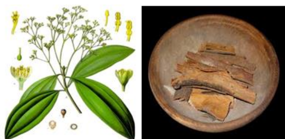
Figure 1. Cinnamomum verum

Different parts of cinnamon such as leaves, bark, root bark and fruits have various amount of resinous compounds (Table 2). Cinnamaldehyde, cinnamate and cinnamic acid are the main resinous ingredients found in cinnamon that increase in quantity when cinnamon ages (Figure 2). Cinnamaldehyde is responsible for its spicy taste and fragrance. Essential oils, such as trans -cinnamaldehyde, cinnamyl acetate and eugenol are found in cinnamon (15, 16).