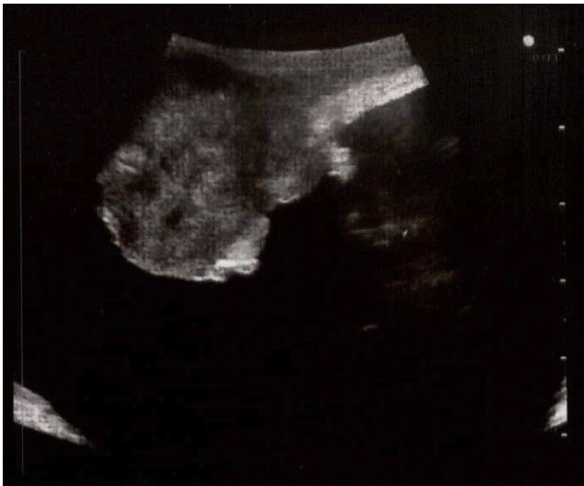
Figure 1. Ultrasound imaging used to determine the margins of the bladder mass.

were sent to pathology and returned as negative. The cystostomy was repaired using running barbed suture and the bladder was filled easily with 300 mL of normal saline to ensure water-tight closure and adequate remaining capacity.