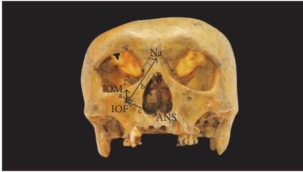
FIGURE 2: Measurements taken to determine the position of the IOF. IOM: inferior orbital margin, Na: nasion, and ANS: anterior nasal spine. a: the vertical distance between the IOF and IOM. b: the distance between the IOF and Na. c: the distance between the IOF and ANS.

In order to analyze the size and the relative position of the IOF, the following parameters on the right and left sides were measured using a digital vernier caliper to the nearest 0.01 mm (Mitutoyo, Japan):