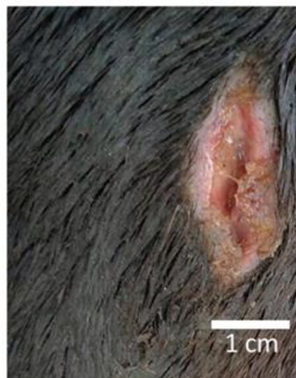
Fig. 1. Erupted abscess-like skin lesion of ~4 cm in length and ~1 cm in width on the right forehead pastern of the horse.

One year later, a closed, swollen abscess-like structure was developed on the right forehead pastern. The abscess erupted within two to three days and presented a bloody skin lesion of ~4 cm in length and ~1 cm in width (Fig. 1).