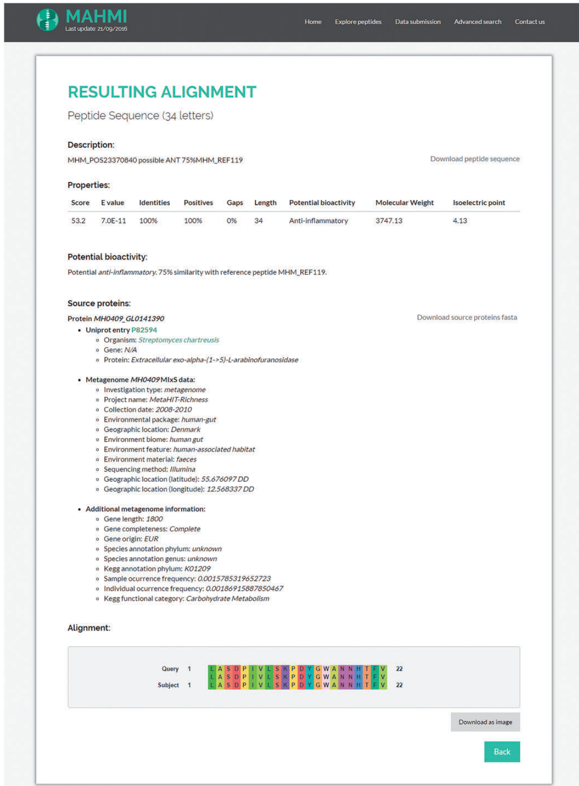
Figure 5. Snapshot of the hit alignment information. Properties table includes the high-scoring pair attributes of the hit, bioactivity (potential bioactivity, in the case of in silico predictions), molecular weight and isoelectric point. Source proteins are cross-linked to UniProt and Metahit metagenome entries. The alignment figure compares in more depth (amino acid by amino acid) the alignment of the proposed hit with the query sequence.