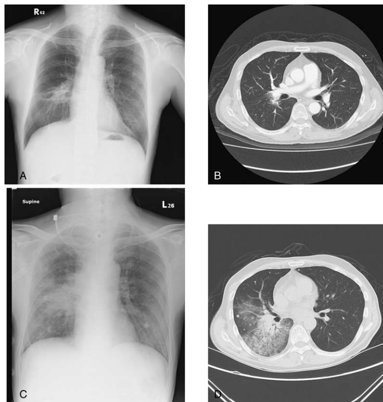
Figure 1. In patient 1, a 54-year-old man with advanced melanoma received a trial of anti-PD-1 treatment with pembrolizumab combined with radiotherapy. Before anti-PD-1 treatment, chest radiograph (CXR) and computed tomography (CT) revealed pulmonary lesions over bilateral hilums (A and B). After 4 cycles of anti-PD-1 treatment, the findings significantly progressed and air-bronchograms at right lower lobe with obstructive pneumonitis was found (C and D). CT = computed tomography, CXR = chest radiograph, PD-1 = programmed cell death protein 1.

In May 2013, a 79-year-old man with adenocarcinoma of proximal jejunum with splenic flexure colon invasion, carcinomatosis, and lung metastasis visited our hospital. Initially, he