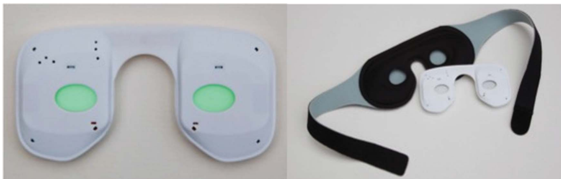
Figure 1 Principal components of OLED sleep mask. Left panel: plastic pod containing OLED light source delivering light at 504 nm peak for a maximum of 8 h with dose delivery sensor. Right panel: soft cushioned fabric mask that houses the plastic pod.

Adverse events including discomfort, sleep disturbance, mood alterations, daytime wakefulness, and