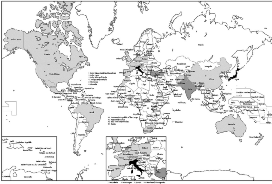
Figure 3. Countries of origin of genetically confirmed Werner syndrome patients. In black are countries (Japan and Sardinia, Italy) with known founder mutations with heterozygous frequencies of approximately 1/150. Dark gray indicates countries with possible founder mutations where more than three independent pedigrees with the same mutations have been reported. In light gray are countries with WS patients with documented WRN mutations.