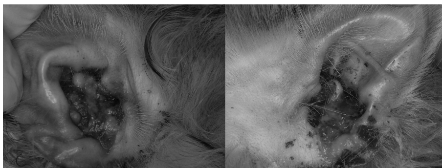
Fig. 1. Lesions of both ears at the initial visit.