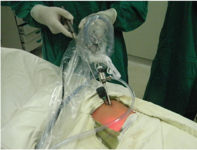
Figure 1. One 3-mm and one 5-mm trocar were inserted through the umbilicus.

The operating assistant maintained tension on the end of the suture outside the abdominal cavity, and a 3- or 5-mm needle holder was used to manipulate the end of the suture inside the peritoneal cavity (Fig. 3). Before the knot of the purse-string stitch was tied, the hernia sac was compressed to expel the gas and liquid within the sac. A triple knot was then performed. Airtightness was confirmed by the absence of hernial sac enlargement when the intraperitoneal pressure was increased. The same procedure was performed on the contralateral side if the processus vaginalis was patent. No stitching was required for the needle and trocar puncture wound. The operative port sites were covered with sterile aseptic absorbent gauze and