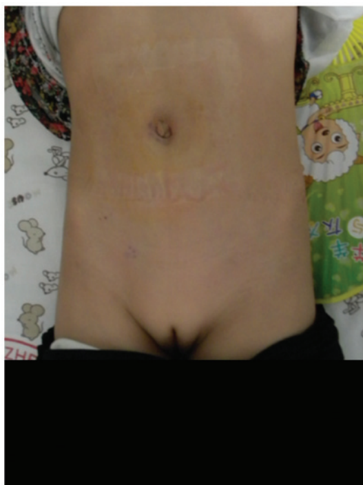
Figure 4. One-day postoperative image of a female patient with bilateral inguinal hernias.

technique involves percutaneous closure of inguinal hernias, tissues between the skin and hernial sac, including nerves and muscles, may be injured by their inclusion in the suture line, which potentially increases postoperative morbidity in the long-term. To preserve the advantages and overcome the limitations of the single-port technique, we designed a novel technique with which to close inguinal hernias with transumbilical laparoscopic intraperitoneal closure in female pediatric patients.