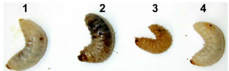
Figure 3. Larvae of the Diaprepes root weevil, 24 h post inoculation with homogenate from a iridescent virus-6 (IIV6) infected larvae, showing the range of pathogenicity. 1. Control larvae injected with water. 2. Larvae darkening, blackish color usually dies 3 - 4 d post inoculation. 3. Larvae yellowish color, usually dies 5 - 7 d post inoculation. 4. Larvae normal coloration, covertly infected, no visible symptoms.

Modes of transmission and persistence of iridovirus in nature are still being discovered (Williams, 1998). In this study, virus transmission between caged D. abbreviatus may occur through contamination of surfaces, contact during mating, or through the spiracles as an aerosol. Sexual transmission from males to females may be expected based on the observations by Marina et al. (1999) which reported sexual transmission of iridovirus in mosquitoes. Transmission of virus during sex may be accomplished during the transfer and absorption of proteins by females during mating (Harari et al. , 1999; Wolfner, 1997). Results show that infected females produced infected eggs, showing IIV6 can be vertically transmitted to the eggs. Vertical transmission has also been reported for iridoviruses in mosquitoes (Woodward and Chapman, 1968) and insect tissues found to be infected included ovaries, as well as the