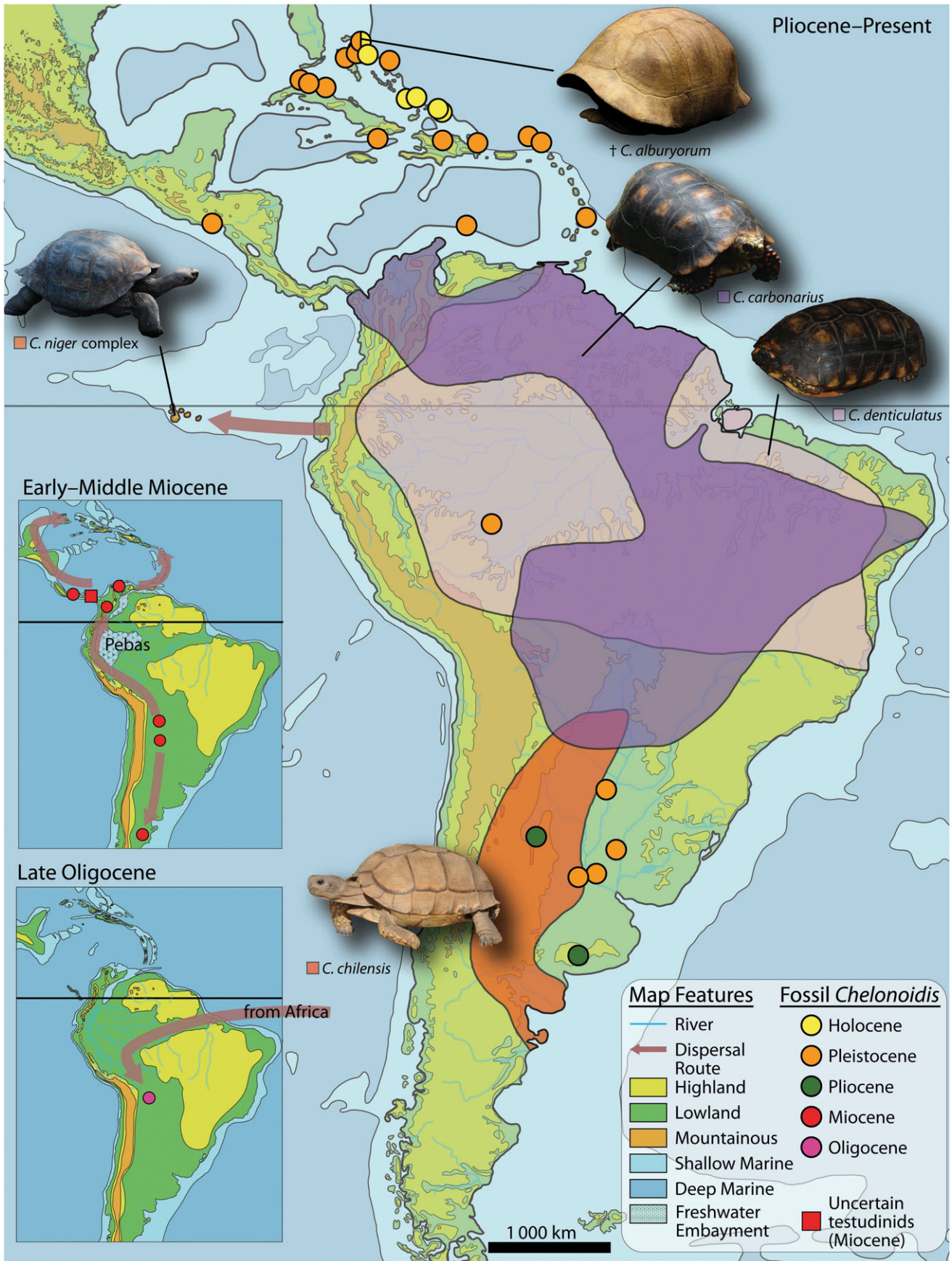
Figure 2. Extant and fossil occurrences of Chelonoidis and dispersals through time. For details, see electronic supplementary material, table S1.

by only approximately 7 mya and predates the divergence of Galápagos and Chaco tortoises by approximately 3.5 mya. Owing to human activities during the mid- to late Holocene, the entire Caribbean tortoise radiation was lost, as was the case for the sloths that once occupied the Greater Antilles [61]. This loss of the Caribbean tortoises is another example