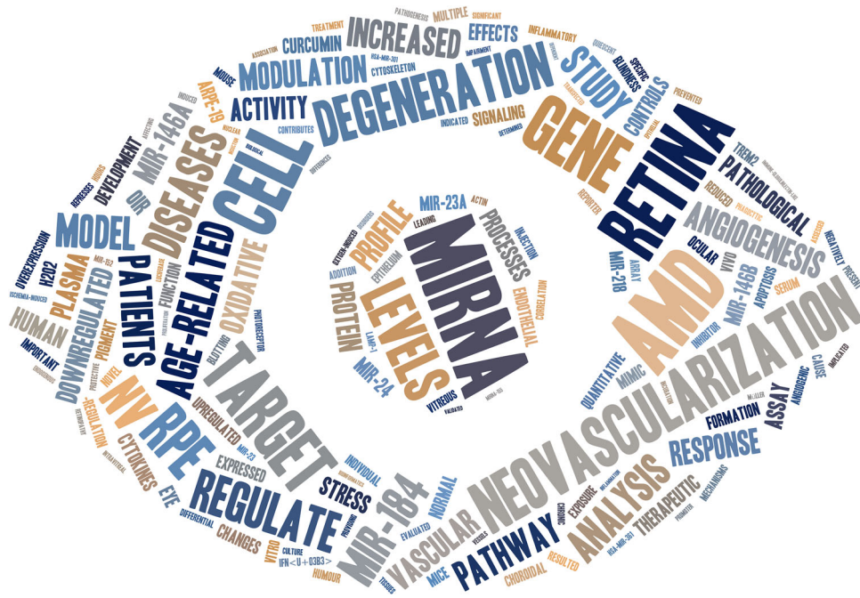
Fig. 1 Word-cloud representation of words found in abstracts related to the search term “miRNAs and AMD”. All words with an occurrence greater than 4 are plotted and their relative abundance is indicated by the size of the respective word. Figure was plotted with

Tagxedo ( http://www.tagxedo.com/app.html ) using words from the abstracts of 21 publications related to miRNAs in AMD [51, 52, 56, 57, 71, 73–75, 77, 82, 89, 90, 99, 103–110]