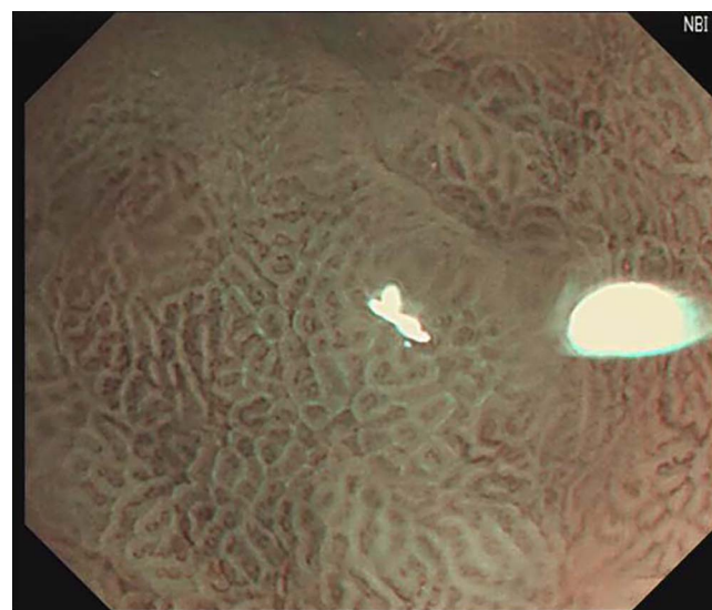
Figure 1 Light blue crest sign indicating gastric intestinal metaplasia on magnifying NBI. NBI, narrow band imaging.

Of worthy mention, BLI is a new computer chromoendoscopy method developed by Fujinon, Fujifilm Medical Company, which uses two lasers; one at wavelength 450 nm, to irradiate white colour illumination, and the other at 410 nm, to enhance surface microvasculature patterns. 40 Although there are few prospective studies evaluating the utility of BLI in gastric cancer screening, BLI has been shown to provide excellent endoscopic images to better characterise gastric lesions. The BLI-bright mode is the main highlight of this new technology, which allows for vascular contrast detection from a far view, thereby enabling its application in screening endoscopy; Kaneko et al 41 demonstrated that BLI-bright mode compared with NBI had appreciable vascular-mucosal contrast from a significantly further distance (26.8 mm vs 16.4 mm, p=0.03 ), among 14 patients with gastric adenoma. Of note, six of 14 patients with gastric