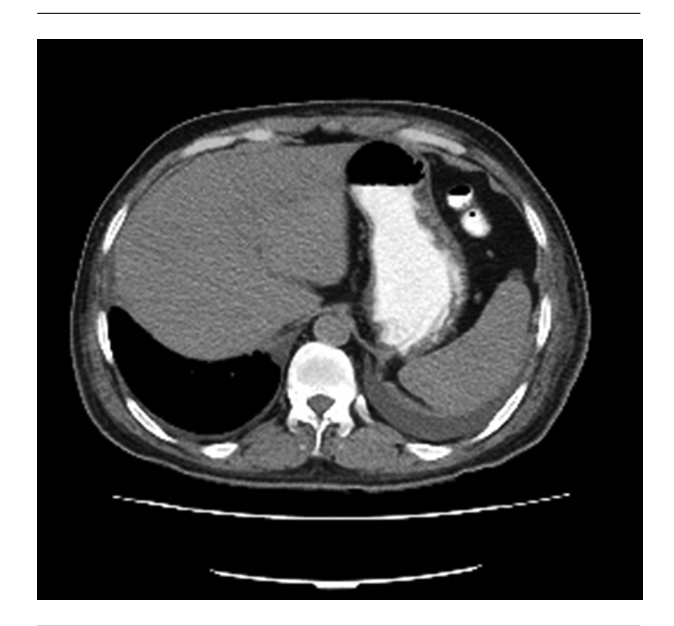
Figure 2. Lung CT scan showing pleural effusion.