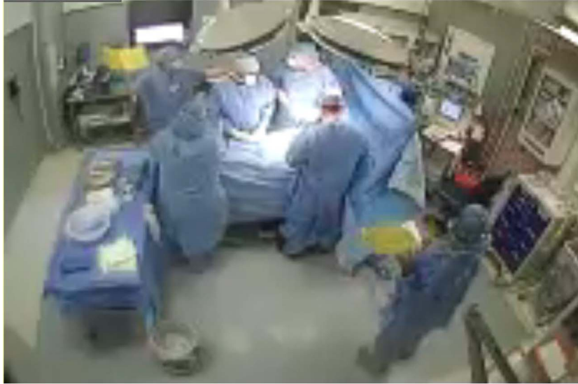
Figure 1 Wide-angle camera displaying blurred image of operating room and use of yellow surgical safety checklist.

operative time during the baseline phase (see online supplementary figures S2 and S3). Rooms with mean non-operative time of less than 300 min and average of 3.8 cases per day were classified as ‘fast’ rooms while rooms with mean non-operative time of greater than 300 min and average of 2.1 cases per day were classified as ‘slow’ rooms (see online supplementary figure S2). Subsequently, the ORs were stratified into fast and slow groups and randomised to feedback and no-feedback treatment groups.