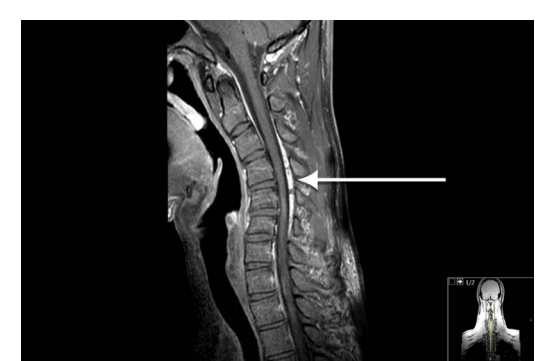
Figure 2 MRI in flexion shows enlarging of the epidural space.