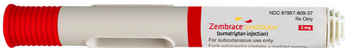
Figure 1 Zembrace ® SymTouch ® disposable single-use two-step autoinjector.

Sumavel ® DosePro ® is a prefilled, single-use, disposable, needle-free system designed for SC delivery of 6-mg sumatriptan into the abdomen or thigh through instantaneous liquid injection (Figure 2). To prepare for injection, patients snap off the gray end cap and flip down the green lever. When ready