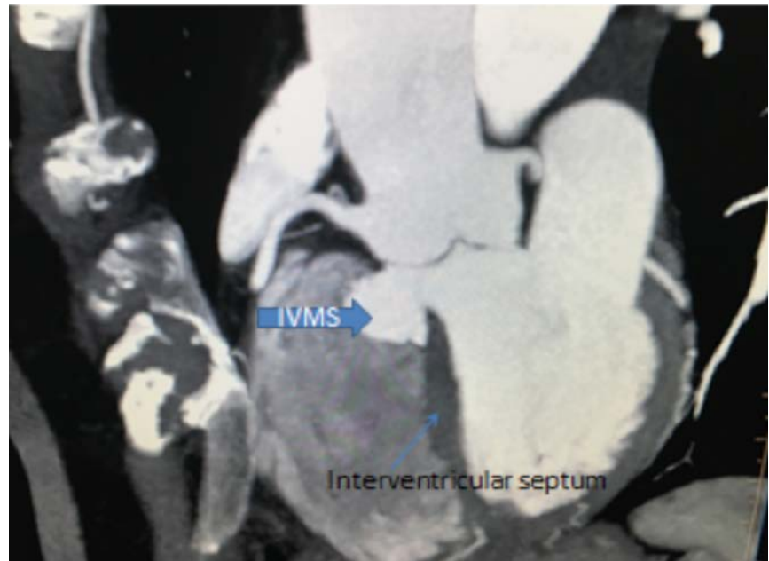
Figure 1. Computed tomographic angiography showing interventricular membranous septal (IVMS) aneurysm (blue arrow): lateral view.

Arrhythmias and complete atrioventricular block is common. Anatomically, the membranous septum lies on an important electric circuit of the heart. Any stretching of the conducting system at the base of the