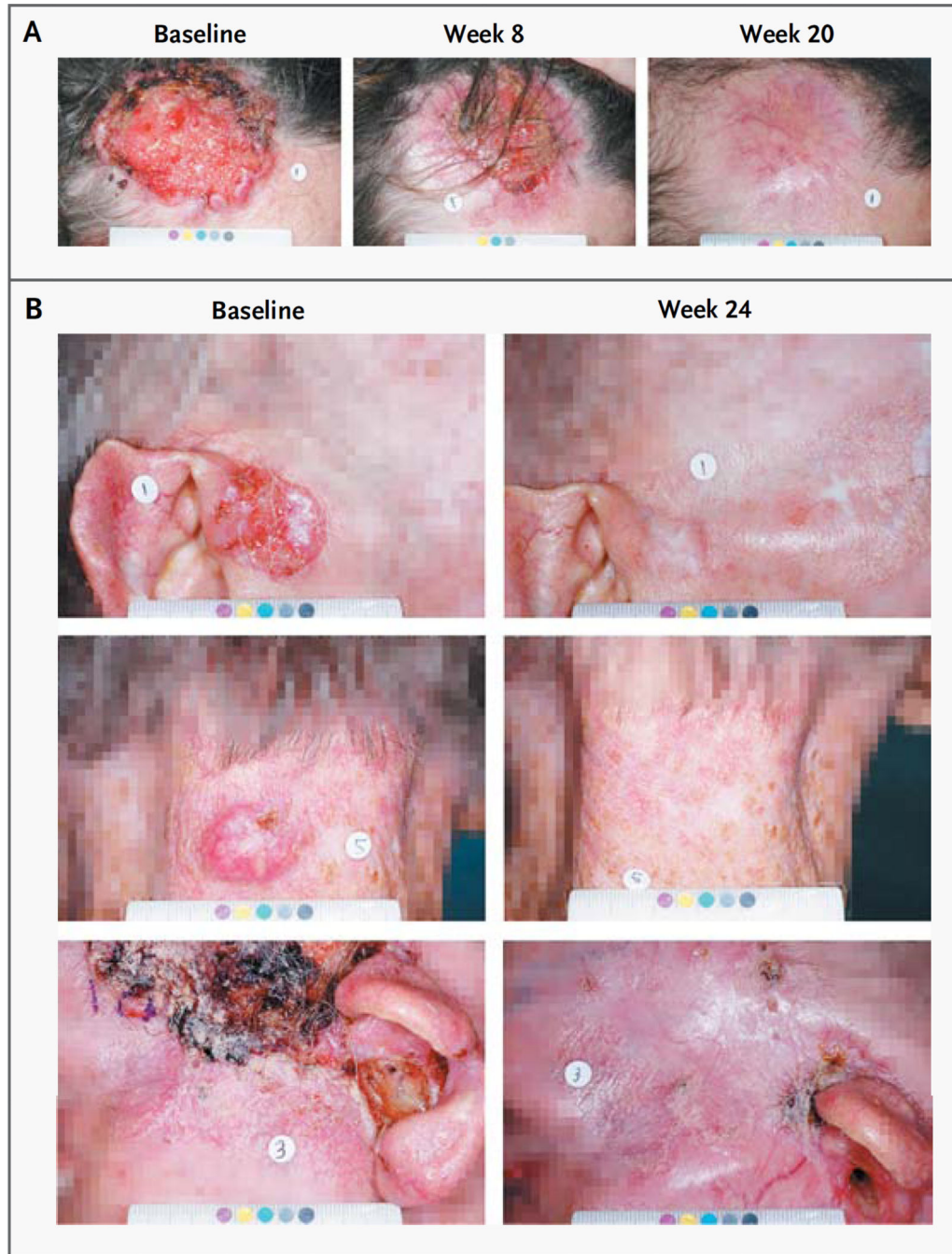
Figure 2. Photographs of Lesions before and during Treatment in Two Patients with Locally Advanced Basal-Cell Carcinoma

Panel A shows locally advanced basal-cell carcinomas on the scalp and forehead of a 68-year-old woman; substantial deformity was anticipated from surgery. No prior surgeries other than biopsies were reported. Radiation therapy was considered to be contraindicated, owing to multiple coexisting conditions and a risk of damage to the brain. No residual basal-cell carcinoma was detected in biopsy specimens obtained at week 16. This patient was considered to have had a complete response, according to the independent review and the site investigator. Panel B shows three of five target lesions (on the right temple, back of the