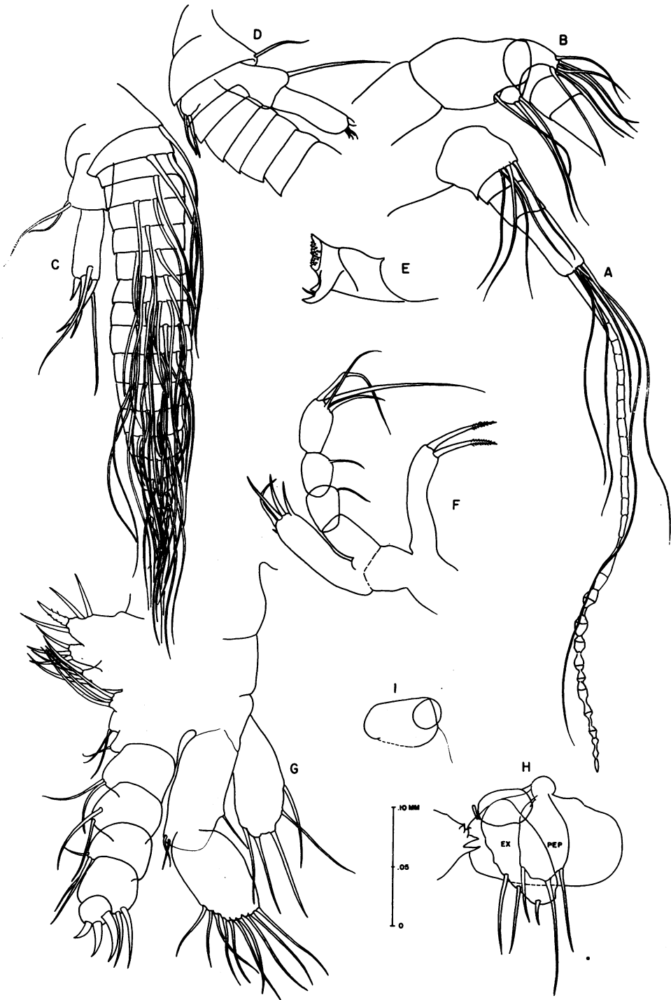
FIG. 2.—A, antennule with terminal part of filamentous portion twisted. B, basal section of antennule, showing small articulating knob. C, antenna. D, basal section of antenna, showing knoblike eminence. E, mandible. F, maxilla. G, first thoracic appendage. H, ninth thoracic appendage, showing interlocking processes of gnathobases; EX, exopodite; PEP, pseudopodite. I, rudimentary tenth appendage.