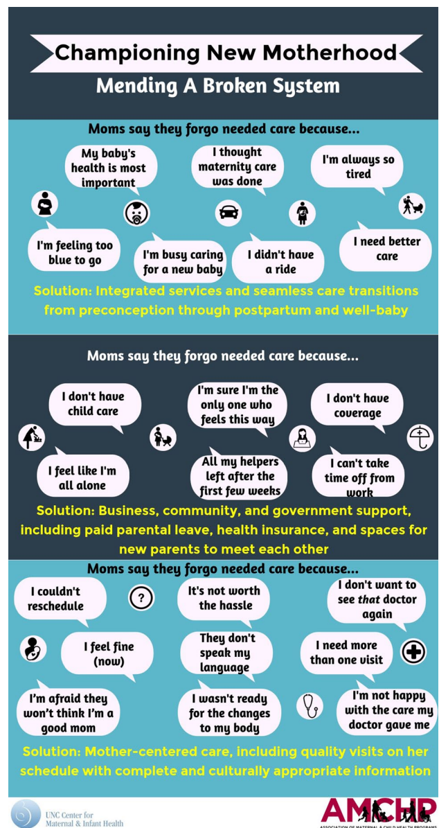
Fig. 1 Infographic of proposed solutions for improving systems of postpartum care

This is a critical time to make meaningful change for postpartum systems of care. The MCH community has a shared understanding of the influence of the postpartum period on the health of women, infants, and families, from mental and emotional health to breastfeeding to birth spacing and contraceptive use, and the period of tremendous transformation that it represents for women and families. Diverse sectors must work together to implement the best available science at all touchpoints with women during the postpartum period. The challenge ahead is to identify gaps in evidence, prioritize the most meaningful research questions, and engage communities, especially women, in designing, testing, and implementing solutions. Public health and in particular, Title V, has an important role to play in evaluating new approaches and translating findings into action to ultimately adapt services and supports around