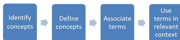
FIGURE 1 Logical model for pediatric AE terminology development.

The major project goal was to provide a common, readily accessible, dynamic resource for describing and cataloging AEs that