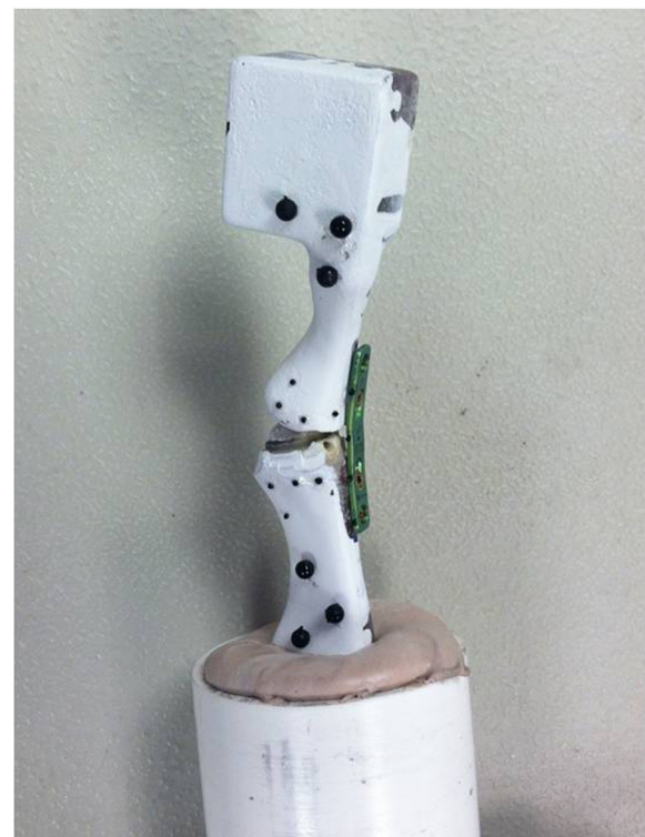
Fig. 1 An image of the marked, painted synthetic composite bones fixed in 2-inch-diameter polyvinyl chloride piping and filled with polymer resin and organic peroxide (Bondo, 3M, St. Paul, MN). The constructs were labeled with markers for the camera tracking. The cadaveric specimens were similarly potted and marked for camera tracking

After painting all specimens white to assist in subsequent optical tracking, the proximal end of the metatarsal was placed into a 2-inch-diameter polyvinyl chloride pipe filled with polymer resin and organic peroxide (Bondo, 3M, St. Paul, MN). Upon hardening, the metatarsal was firmly held in the polyvinyl cylinder. For measurement of the opening of the joint space between the phalanx and metatarsal, black spherical markers (1.5 mm in diameter) were fixed at the joint line of the construct with a cyanoacrylate-based adhesive (Prism, Loctite, Germany). Four 3-mm-diameter spheres were fixed laterally to both the metatarsal and phalanx to simplify gross measurement of the movement of each bone, as needed for tracking each body (Fig. 1).