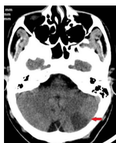
[Table/Fig-1]: Non-Contrast Computed tomography of the brain depicting hypodensity in the left cerebellar hemisphere suggestive of acute infarct. [Table/Fig-2]: Trans-thoracic echocardiogram in parasternal long axis view showing vegetation of size 0.8cm x 1.0cm on the posterior mitral leaflet on left atrium side.

method increased from 0.5 to 2.0. Patient continued to be febrile. Repeated transthoracic echocardiograms showed increase in the size of vegetation suggesting treatment failure. In view of MRSA demonstrating vancomycin creep phenomenon (with increasing MICs from 0.5 to 2), treatment was switched over from vancomycin to daptomycin with regular monitoring of renal parameters including