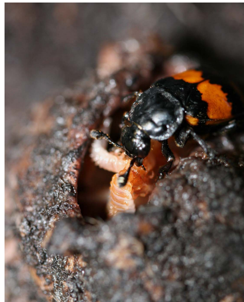
Figure 1 | A female burying beetle feeding her offspring. In this species, a parent spends around 72 h preparing a carcass, after which larvae hatch and arrive at the carcass. Once larvae arrive, parents spend a further 72 h feeding larvae (with peak parenting 12–24 h after larval arrival), and then disperse around 100 h after larvae first arrive on the carcass. Larvae disperse fully grown around 125 h after their arrival on the carcass. As shown here, feeding involves direct mouth-to-mouth contact and a transfer of pre-digested carrion from the parent to the offspring.

Here we test the hypothesis that a transition from a non-parenting state to a parenting state will reflect differences in neuropeptides known to be generally associated with mating, feeding, aggression and increased social tolerance and that neuropeptides influencing other traits will not change during parenting. To test this, we estimated the abundances of neuropeptides of the burying beetles N. vespilloides sampled from a solitary and parenting states. N. vespilloides adults are normally solitary but switch to parenting in the presence of appropriate resources. Parenting in this species is extensive and elaborate. Adult beetles are stimulated to parent after they locate a vertebrate carcass and bury it. Parents remain on this carcass and provide indirect care by removing the fur or feathers and forming a nest within the carcass. They also repeatedly coat the carcass with excretions that retard microbial growth. Eggs are laid in the surrounding soil, hatch and larvae crawl to the crypt where they interact with one or both parents. Direct parental care involves feeding larvae pre-digested carrion by regurgitation for the first two days of larval life (Fig. 1). Parenting occurs for 75% of larval development, yet lasts only days 20 . N. vespilloides is also molecularly tractable with a published genome 21 , allowing for efficient proteomic work.