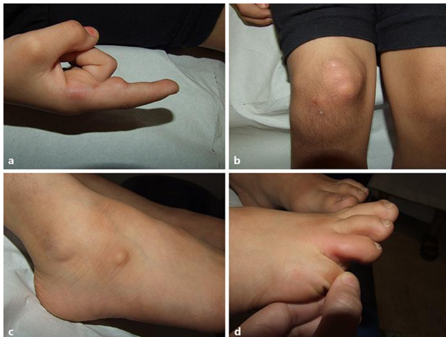
Fig. 1. a–d Multiple nodules of various sizes located mainly around the joints over the right side of the patient's body.