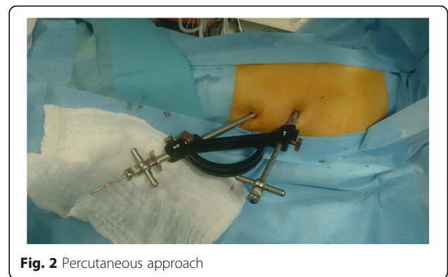
Fig. 2 Percutaneous approach