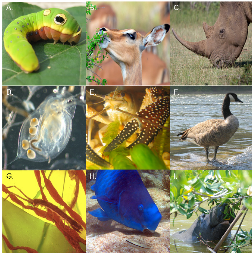
Figure 1. Plant-herbivore interactions shape community dynamics across terrestrial, freshwater, and marine habitats. These interactions encompass a huge range of taxa and organismal size for both plants and herbivores. Common herbivores across these ecosystems are (A) spicebush swallowtail caterpillar ( Papilio troilus ) feeding on spicebush ( Lindera benzoin ); (B) impala ( Aepyceros melampus ) browsing shrubs in an African savanna; (C) white rhinoceros ( Ceratotherium simum ) grazing African grasses; (D) Daphnia dentifera , an important grazer on freshwater phytoplankton; (E) the white tubercled crayfish ( Procambarus spiculifer ) consuming a freshwater macrophyte ( Egeria densa ); (F) Canada goose ( Branta canadensis ), an important herbivore on freshwater macrophytes and terrestrial grasses; (G) the isopod Erichsonella attenuata , a mesograzer of epiphytes and seaweeds in seagrass meadows; (H) blue parrotfish ( Scarus coeruleus ) grazing filamentous algae on a coral reef; and (I) West Indian manatee ( Trichechus manatus ) curiously eating a red mangrove plant ( Rhizophora mangle ).

technology to understand landscape-level predator-herbivore-plant interactions 24 , and (4) statistical advances that allow for comprehensive analyses of multiple co-varying drivers in both observational and experimental studies 25 . Given the array of topics comprising the study of plant-herbivore interactions, our focus was not to exhaustively review this literature. Instead, we point out several exciting and growing areas of research from the past 3 years. We focus on briefly highlighting four areas of plant-herbivore interactions: (1) plant defense theory, (2) herbivore diversity and ecosystem function, (3) the context dependency of herbivory and predation risk, and (4) how a changing climate impacts plant-herbivore interactions. We strived to include a broad array of examples from across ecosystems and, in the process, are likely to have missed many worthy studies. We conclude that the study of plant-herbivore interactions continues to be a leading driver for ecology and evolution in general and that these studies can be used to inform conservation but that efforts need to be redoubled to counter the rapidly changing dynamics of the Anthropocene.