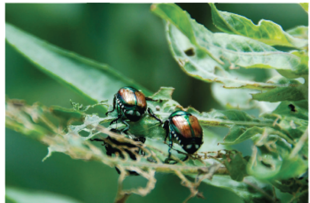
Figure 3. Climate warming may have idiosyncratic effects on plant-herbivore interactions, depending on the species involved. Lemoine et al. 162 showed that increasing temperature affects growth rates of Japanese beetles ( Popilla japonica , at right skeletonizing an Oenothera biennis leaf) differently depending on the plant species they are feeding on. For example, Japanese beetle growth increased with temperature on plants such as Platanus occidentalis (purple points) but declined on species such as Viburnum prunifolium (pink points). These data highlight the difficulty in predicting the impact of climate warming on plant-herbivore interactions. Data redrawn after Lemoine et al. 162 . Image from Dejeanne Doublet.