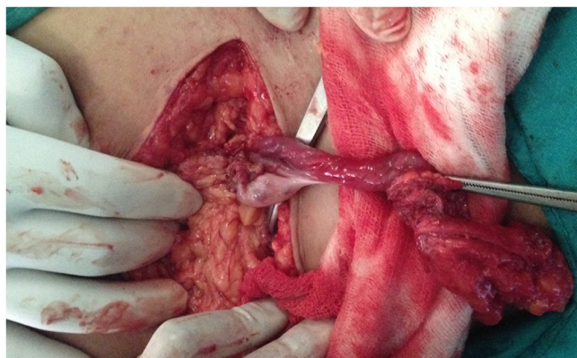
Fig. 2. CT finding confirmed at operation.

discharged on the 3rd postoperative day. No adverse perioperative events occurred.