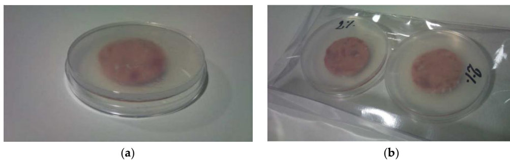
Figure 2. (a) Slice of cooked ham inside a Petri dish including a chitosan film, (b) final package.

Microbial analysis and sampling of meat: Samples were taken weekly for the determination of counts of total aerobic mesophilic bacteria in Plate Count Agar (PCA), incubated at 37 °C for 48 h [5,12]. Mesophilic lactic acid bacteria (MLAB) were determined in MRS agar (Man Rogosa Sharpe) incubated under anaerobiosis at 37 °C for 72 h [5,13]. Enterobacteria were determined in VRBG Agar (Violet Red Bile Glucose), with a double layer to provide microaerophilic conditions, incubated at 37 °C for 24 h. Molds and yeasts were determined in Rose Bengal Agar with Cloramphenicol incubated at 28 °C for 3 days for the yeast count and 5 days for the mold count. Results were expressed as logarithms of colony forming units per gram of cooked meat.