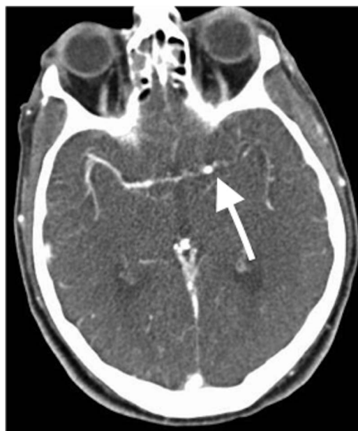
Figure 1 CT cerebral angiogram demonstrating near total occlusion of the M2 segment of the left middle cerebral artery (arrowed).

This case demonstrates that mechanical thrombectomy is an effective means of treating this potentially devastating complication of TAVI.