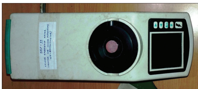
Figure 2: Color measurement using spectrophotometer (original photograph)