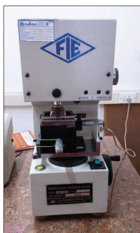
Figure 4: Hardness measurement using Vicker's hardness tester (original photograph)