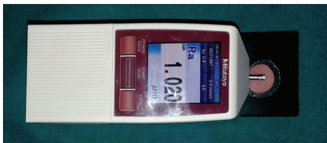
Figure 3: Surface roughness measurement using profilometer (original photograph)