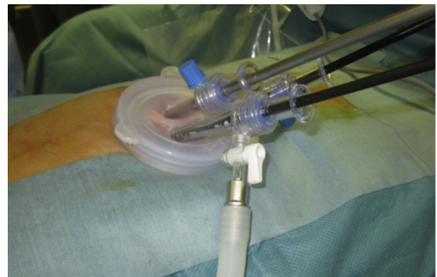
Fig. 2. The three ports secured to the EZ access for the operation.