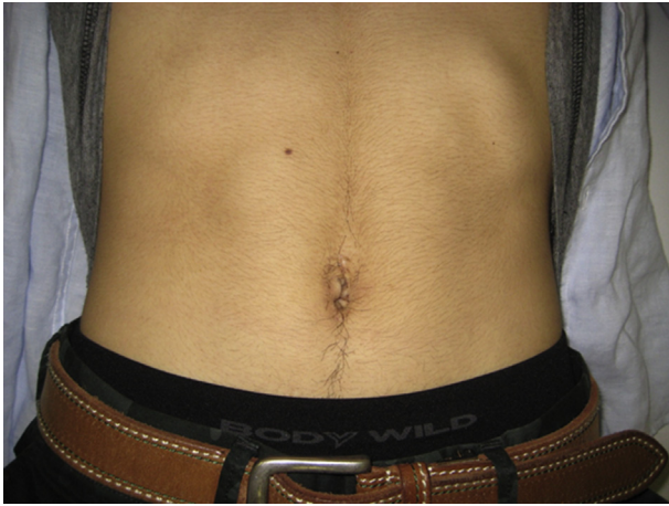
Fig. 3. Postoperative scar.