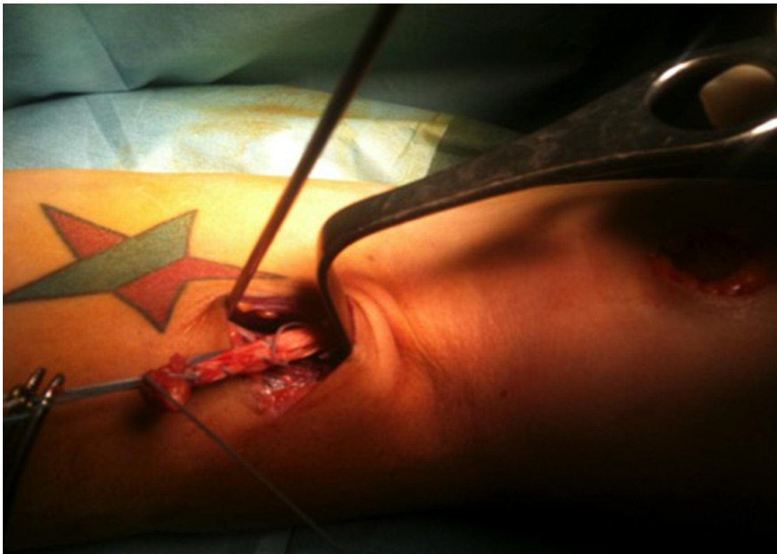
Figure 5. The bicep tendon is passed true the forearm incision and armed with the 2 sutures.