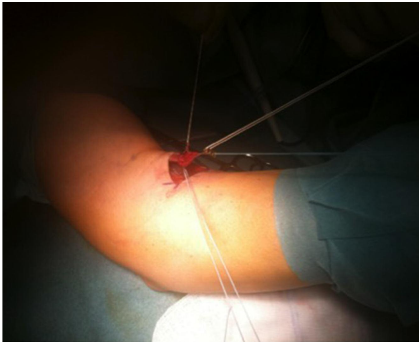
Figure 2. The tendon is fixed with two sutures of different colour with a Krackow suture and at the end secured with an Endobutton free loop (single incision technique).

Different types of surgical treatments (Figs. 2-5), as previously described 12 , including the suture tendon in 6 cases (30%) were performed, these included use of the cortical radial suspension systems with fixed length (Endobutton) in 7 cases (35%), use of metallic anchors on the radial tuberosity in 4 cases (20%) and use of a cortical radial suspension system with editable loop length (ZipLoop, ToggleLoc) in 3 cases (15%). Surgical access with single incision at the level of the radial tuberosity was performed on 13 patients (65%), while a double surgical access, both to the radial tuberosity and to the distal third of the arm was performed on 7 patients (35%). All the patients underwent an X-ray (Fig. 6) to the forearm, antero-posterior and latero-lateral projection post operative. Subsequently, the affected arm was immobilized with a tutor type Gilchrist, valve pinstripe at the brachial forearm or elbow brace locking the flexion at 90° and maintained for 3-4 weeks. Following this pe-