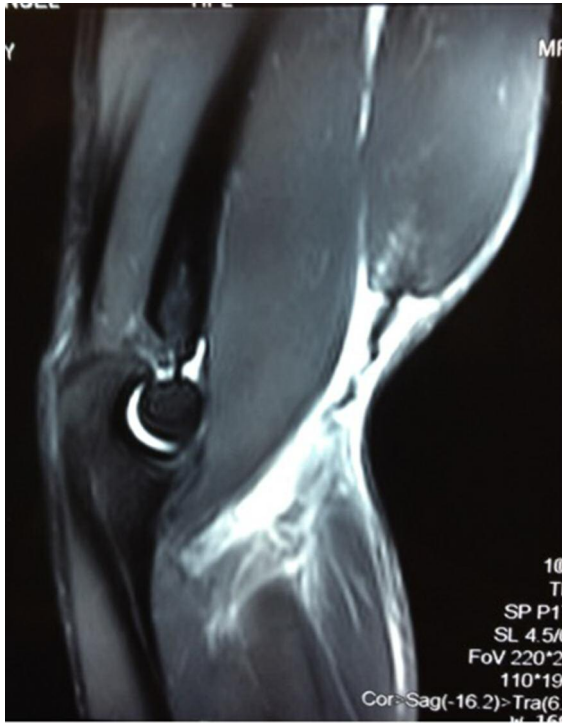
Figure 1. MRI vision of the avulsion of the biceps tendon from the radial tuberosity.

surgically treated for a disconnected distal biceps lesion, 15 with a total lesion and 5 with a partial lesion. All subjects were males and underwent a preoperative MRI (Fig. 1). The age range was between 24-53 years, with a mean age of 36.3 years. The affected