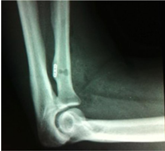
Figure 6. X-ray to the forearm, anteroposterior and latero-lateral projection post operatively.

riod, the patient begins a rehabilitation program after the first month of follow up, then he will have the second follow up after 3 months, and can return to full sports and work about 6 months after surgery to return to sports. The clinical and functional results were studied using an Ewald System Score (ESS), which included an evaluation score of 100 points covered by: pain, function, movement and deformity, with a follow-up clinical and functional treatment performed 6 - 12 - 24 months after surgery without any observed complication.