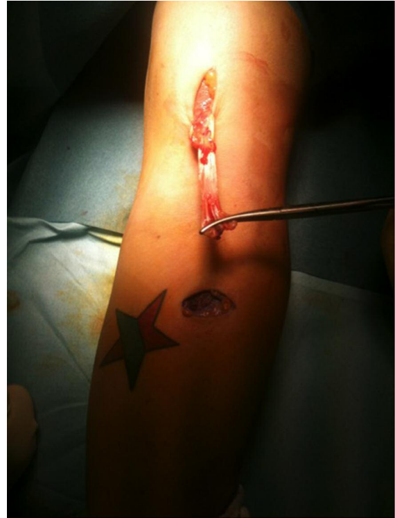
Figure 4. Release of the bicep tendon with the double incision technique.