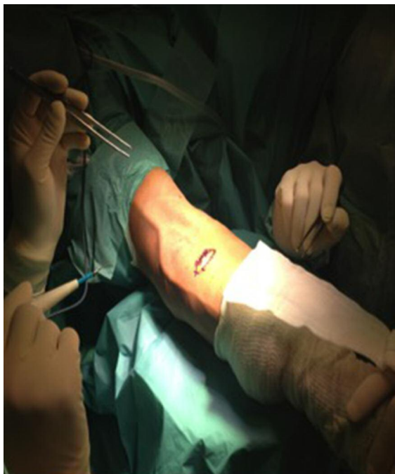
Figure 7. 2-3 cm transverse skin incision.