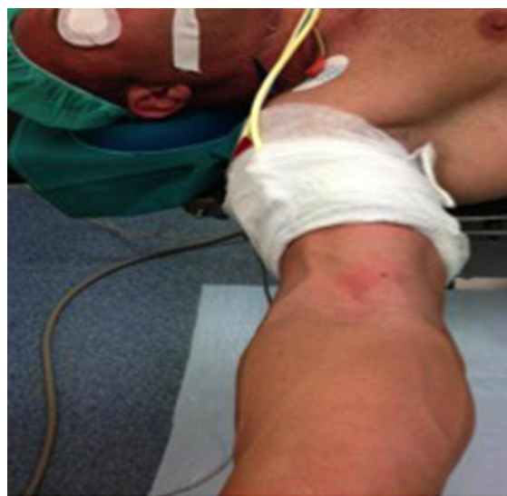
Figure 8. Tourniquet fascia.

Patient management in the post operative is always performed by the application of a guardian or pin-stripe splint for about two weeks at 90°, in order to facilitate the initial reparative processes and reabsorption of the edema, although from the outset patients are granted cautious and gradual movements. Subsequently, they continue assisted active joint mobilization exercises and neuromuscular taping 18 . Muscle strengthening exercises do not begin until at least 2 months after surgery and heavy activity after about 6 months. It is known that surgery is not without complications, which are mainly two types: ectopic that may form between the radius and ulna proximally with pain and reduced joint mobility, and load nerve deficits in the lateral cutaneous nerve, the posterior interosseous nerve or radial nerve 19 . Some Authors have described a different rehabilitation protocol allowing early mobilization of the elbow. This protocol allows mobilization from 4 to 6 weeks after surgical treatment by allowing the active extension of the elbow. Alternatively, patients are allowed to actively ex-