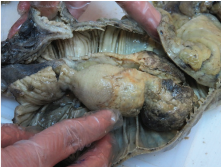
Figure 3. Gross morphology of lesion