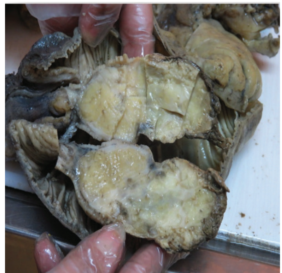
Figure 4. Resected specimen representing fatty consistency

They are mainly found in women between 50 and 60 years old (4, 7-9). Generally, colonic lipoma presents as sessile polypoid structure, originating from the submucosa with an intact mucosa. Commonest location for this benign lesion is on the right side, particularly in the cecum (10). Precisely, Lipoma of the colon is predominantly localized in ascending colon (61% from the reported cases), followed by descending colon (20.1%), transverse colon (15.5%) and in the rectum (3.4%). Multiple lipomas have been shown in 10-20% of the patients, notably if a lipoma was found in the cecum (11). Colonic lipomas are usually asymptomatic but a few of the lipomas have clinical manifestations and symptoms correlated to the size and location of the tumor. Signs and symptoms are more generally related with lipomas larger than 2 cm and including abdominal pain, constipation, rectal hemorrhage and rarely with intussusception, as in our case.