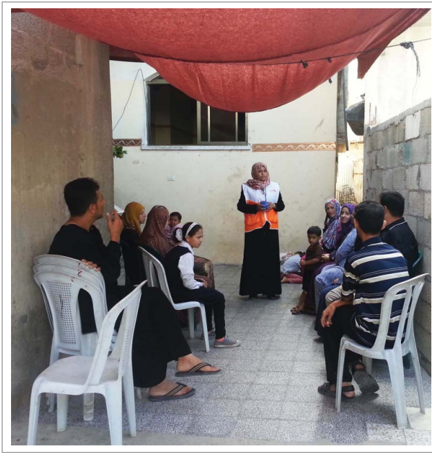
Figure 2. Gaza volunteer provides Psychological First Aid and support to families, in their homes, in the days following the 2014 conflict.

empowering impact on those supporting others in crises. 16,17