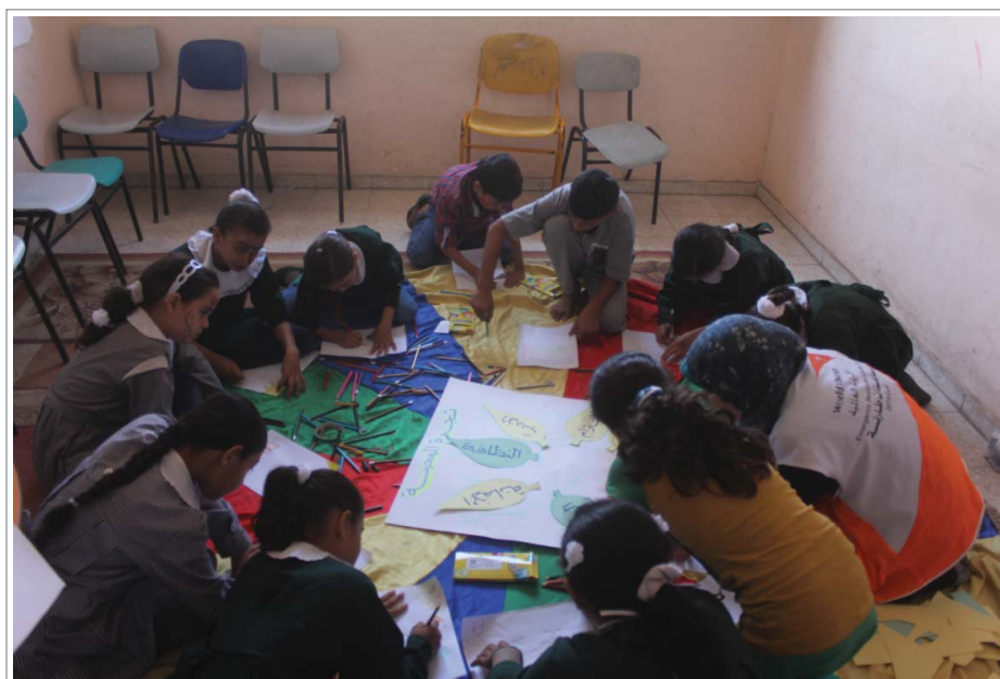
Figure 1. Children attending a World Vision Child Friendly Space that provided them and their families with Psychological First Aid, amongst other psychosocial support activities.