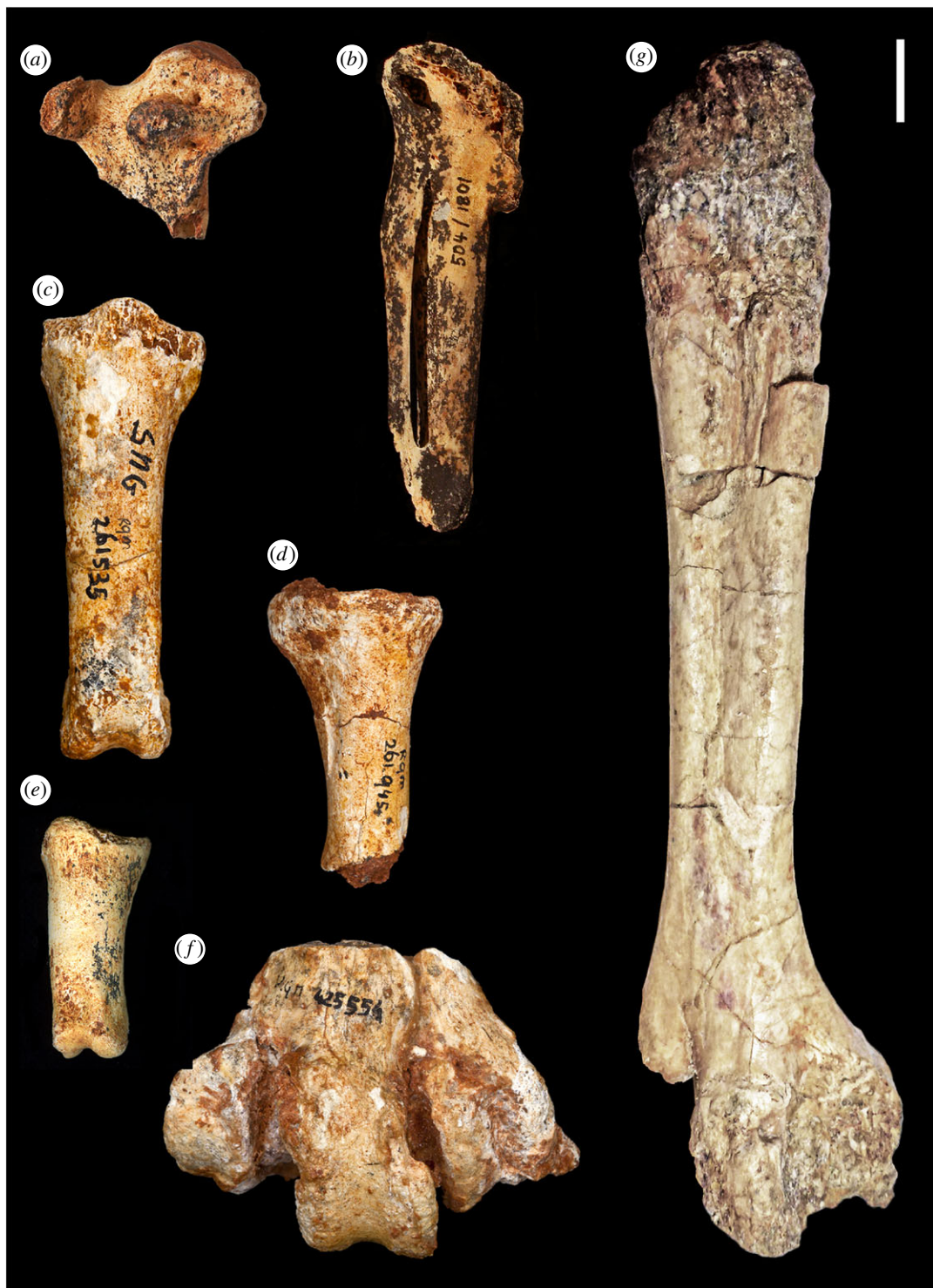
Figure 2. Bones of Garganornis ballmanni Meijer, 2014 from the Late Miocene of Gargano (a–f) and Scontrone (g), Italy. (a) Right carpometacarpus DSTF-GA 49, ventral view; (b) left carpometacarpus NMA 504/1801, ventral view; (c) proximal pedal phalanx RGM 261535, dorsal view; (d) proximal pedal phalanx RGM 261945, dorsal view; (e) mesial pedal phalanx MGPT-PU 135536, dorsal view; (f) left tarsometatarsus RGM 425554, dorsal view; (g) right tarsometatarsus SCT 23, dorsal view. Scale bar represents 1 cm.

Measurements: DSTF-GA 49: proximal width, 27.7 mm; proximal depth, 10.5 mm. NMA 504/1801: total length as preserved, 53.6 mm. DSTF-GA 77: proximal width, 43.2 mm; proximal depth, 31.0 mm (estimated). SCT 23: total length of preserved specimen, 168.2 mm; distal width, 22.5 mm (estimated); width of shaft at mid length, 18.3 mm. RGM 425554: distal width, 47.5 mm; distal depth, 24.8 mm