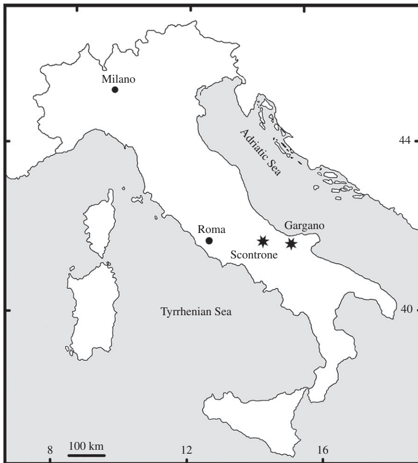
Figure 1. Map of Italy with the location of Gargano and Scontrone.

Tring, UK (NHMUK) and in the Ditsong National Museum of Natural History, Pretoria, South Africa (TM). The osteological terminology follows Baumel & Witmer [30]. The circumference of tibiotarsi of selected fossil Anseriformes at the National Museum of Natural History in Washington D.C., USA were measured by wrapping a thin strap of paper around the thinnest portion of the tibiotarsus and measuring the minimum circumference with sliding calipers calibrated to the nearest 0.05 mm. Body mass was then estimated using the least-squares regression estimates of Iwaniuk et al. [31].