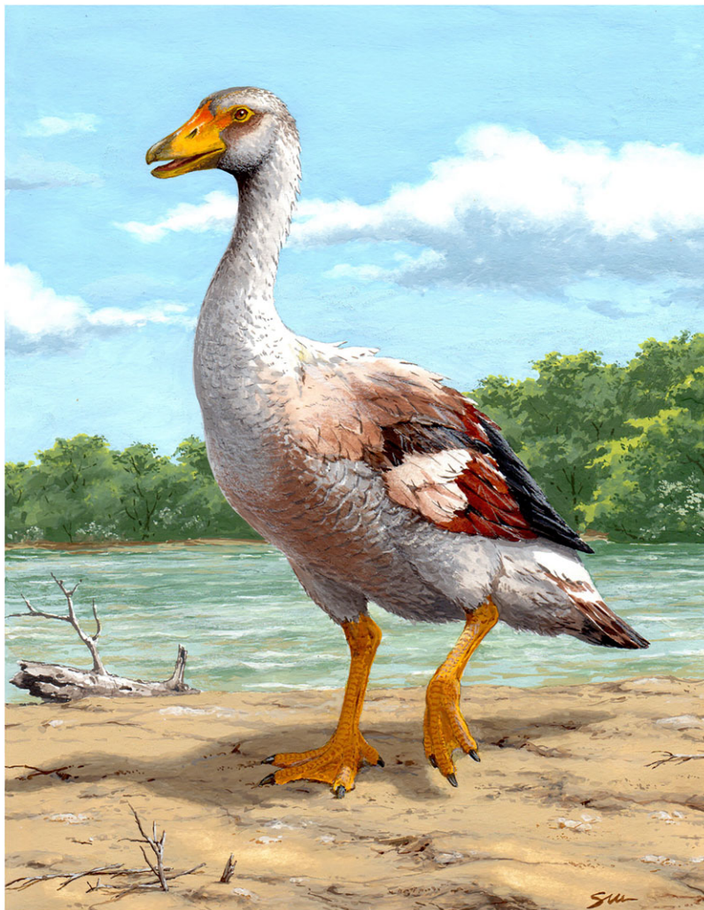
Figure 4. Reconstruction of Garganornis ballmanni Meijer, 2014 based on the newly described fossil remains. This reconstruction is based on a generic Western Palaearctic Goose with short and robust tarsometatarsus, short toes and very short wings according to the known elements of Garganornis ballmanni . Illustration made by Stefano Maugeri.